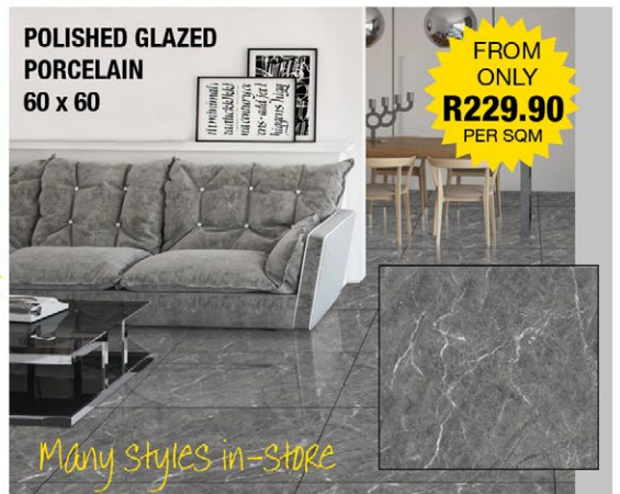
POLISHED GLAZED PORCELAIN 60 x 60